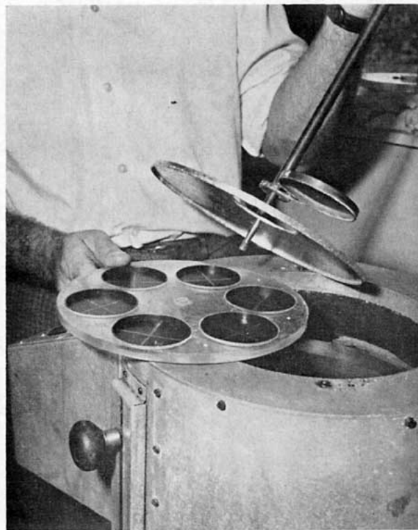
Fig. 1. Apparatus for measurement of time lag in nucleation showing the six brass trays with covering and rotating mechanism.

so that when the sample was injected into the chamber, about 100 crystals were observed in the first tray. By using graded time intervals, depending on the number of crystals in each tray, observation times of up to 20 minutes could be obtained, trays with few crystals being used twice. During this time 6 to 10 readings were obtained. Each of these readings is represented by one point of Figs. 2 and 3 derived in the manner described in the next section. In all observations care was taken to prevent ice formation on the cylinder walls, trays and exposing mechanism, by coating them with a film of glycerine before each experiment.