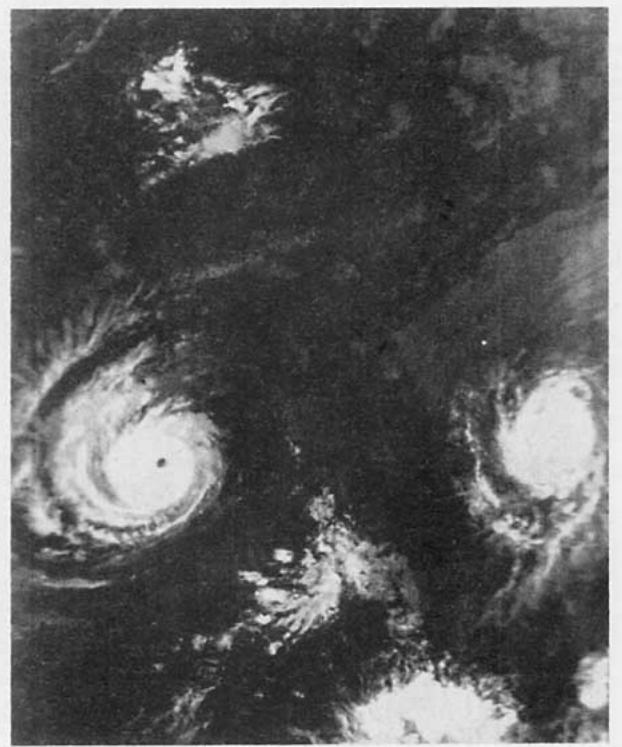
FIG. 3. Infrared data corresponding to Fig. 2. White represents effective radiating temperatures of 190K or colder, and the darker shades represent progressively warmer temperatures.

indicated that the clouds to the northwest of Diana were below the trade inversion. The tops of the cirrus shields for both storms were determined to be in excess of 13 km.