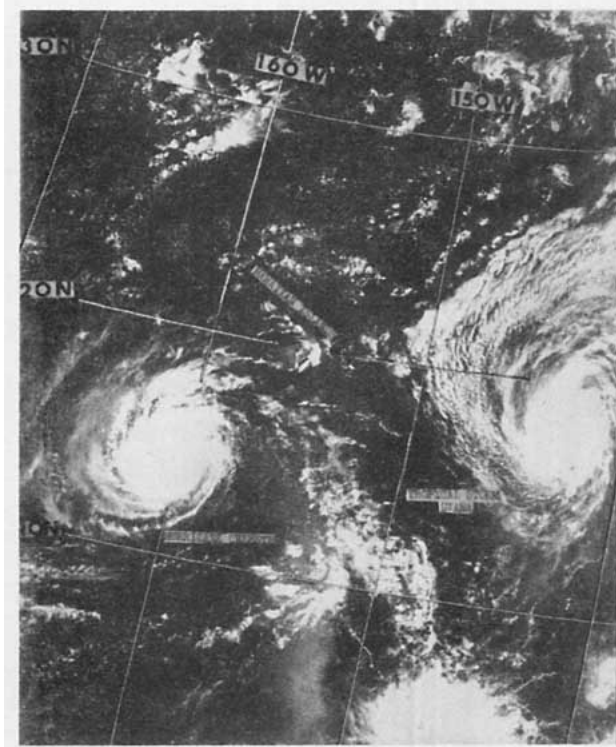
FIG. 2. Air Force Weather Service visual-range DAPP data, 2200 GMT 16 August 1972.