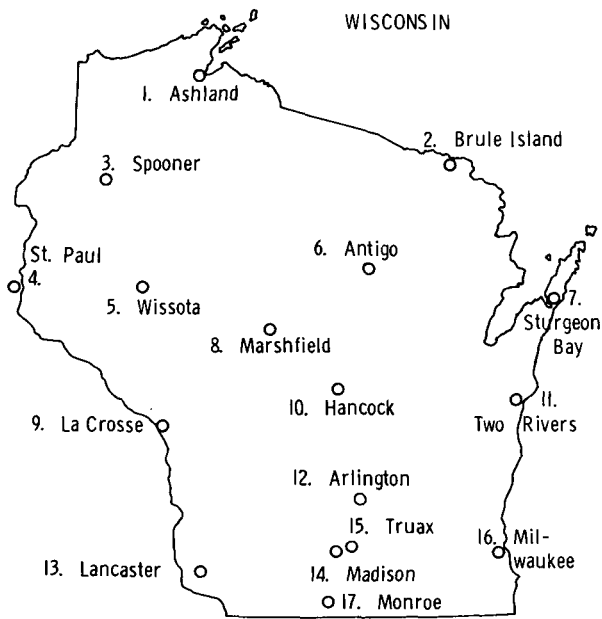
FIGURE 1.—The pyranometer network in Wisconsin and St. Paul, Minn.

clear day variations in the atmospheric concentrations of aerosols and precipitable water are eliminated. Therefore, the variability in “percent-radiation” (the normalized data) is primarily due to the effects of the changing patterns of cloudiness, and secondarily to the changes in the atmospheric concentrations of aerosols and precipitable water which occur on cloudy days.