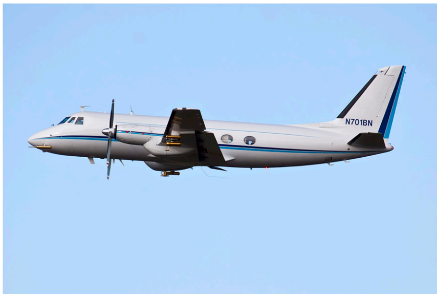
FIG. 10-2. The G-1 aircraft in flight equipped for a cloud mission.

The separately funded ARM Unmanned Aerospace Vehicle (UAV) program carried out 12 missions between 1993 and 2006 relying on both UAVs and piloted aircraft. ARM-UAV has really pioneered the use of UAVs for scientific research. Particularly noteworthy is the successful completion of a >26-h UAV flight on 5 October 1996, which marked the first >24-h mission of a UAV gathering data for science applications. Equally impressive are high-altitude flights in 1999 with the Altus II above Hawaii. This marked the first time a UAV performed nadir-looking remote sensing of cirrus clouds by flying at altitudes above all clouds.