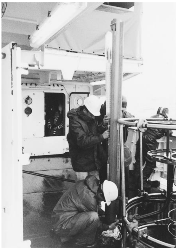
FIG. 3. For a precise and gentle installation of the first float park we constructed a launch apparatus. It is operated by a rosette sampler of a CTD system. During lowering the vertical pipe holds the float to be moored.

memory (16 kB ROM and 32 kB RAM). The available FORTH software had to be extended for the delayed functions. Newly introduced FORTH words include “wire on/off” for servicing the first release block, which separates the moored float from its 12-kg dinghy anchor. RS232 compatible communication with the instrument’s processor is established by an optical link directly attached to the glass hull for programming and download sessions. In terms of costs the dual release version exceeds its parent by less than 5%.