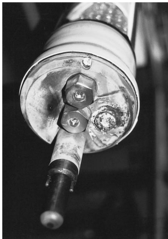
FIG. 2. End plate of dual release float No. 414 after recovery by FS Poseidon . The black hydrophone for the reception of acoustic signals with its extender pipe stuck through the released cylindrical ballast weight. The two hexagonal release blocks are displayed at the center of the photograph. On the right-hand side we see the strongly corroded valve screw. The instrument was under water for 15 months.

The technical realization of the first RAFOS float park was conducted through the cooperation of the Institut für Meereskunde in Kiel, Germany, and SeaScan of Falmouth, Massachusetts. The instruments are a derivative of the float generation built by SeaScan according to the design and specifications evolved by T. Rossby and B. Owens and their teams at the University of Rhode