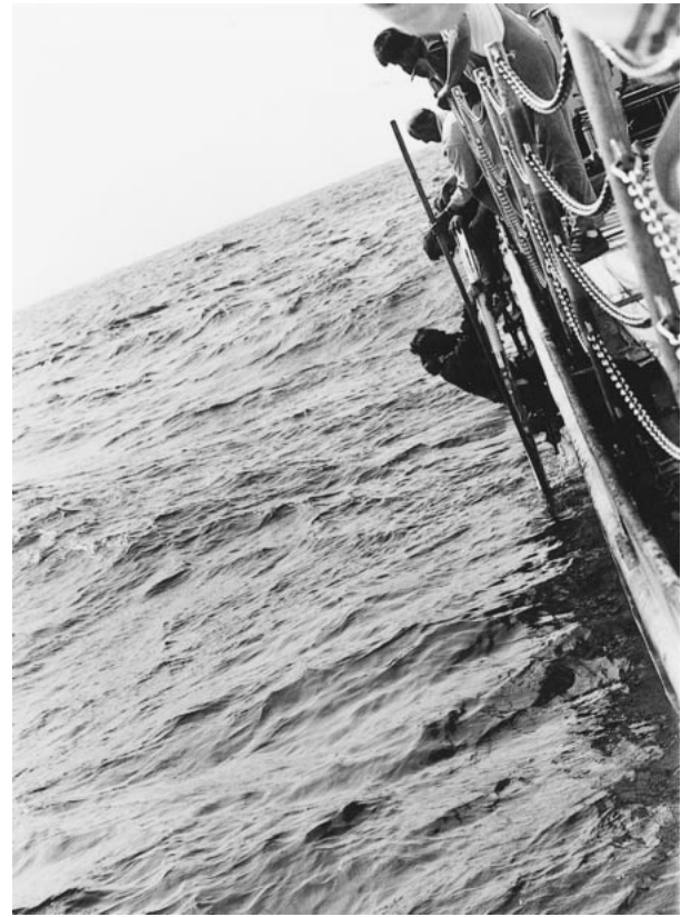
FIG. 5. Although RAFOS floats are built as expendable instruments three surfaced instruments were recovered from board the FS Poseidon . The picture shows a sailor in a survival suit with life line at calm weather conditions. He captured the drifting float from the pilot's ladder and hands it on board where the instrument was warmly welcomed after 15 months in the water. Severe corrosion damage was detected on this float on the valve of the end plate (see Fig. 2).

DRF = Dual release RAFOS float; StdF = Standard RAFOS float; ↓ = Launched; ↑ = Surfaced and recovered; ± = Surfaced.