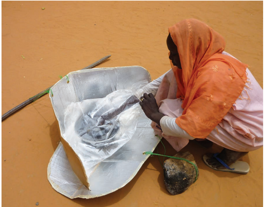
FIG. 1. A solar cooker in use in Chad. Foil glued to cardboard reflects energy onto a darkened cooking pot placed inside a clear plastic bag, cooking even dried food in around 3 h.

Agrometeorological Applications Associates and TchadSolaire (AAA/TS) have been training refugees and the indigenous population in Chad to use and manufacture solar cookers since 2005. In several camps, teams of refugee women now handle most of the maintenance and furnishing of cookers, training, and finance (including the impending con-