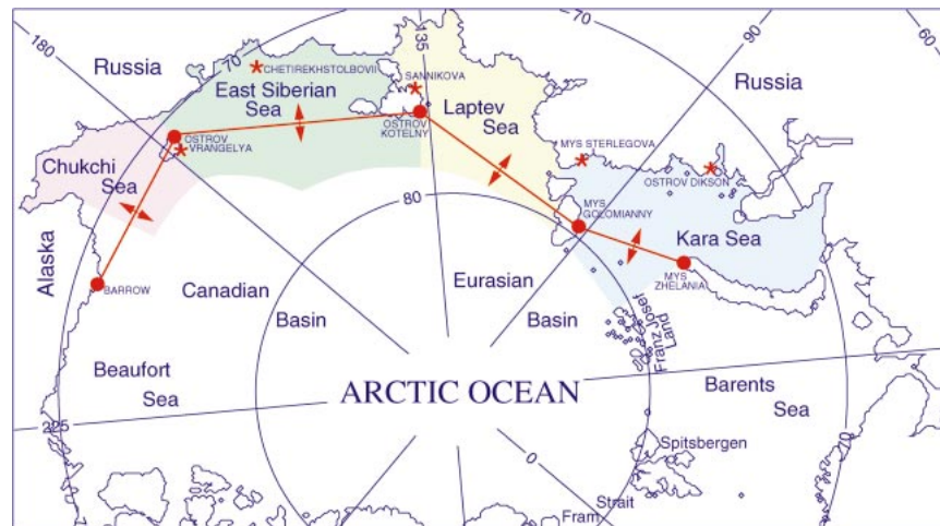
FIG. 1. Map of the Arctic Ocean, with colors denoting ice extent analysis regions. Locations of sea level pressure observations are shown by red dots. Red stars denote stations where ice thickness data were collected. Red lines denote locations of cross sections used for analysis of the modeling ice and water transports.