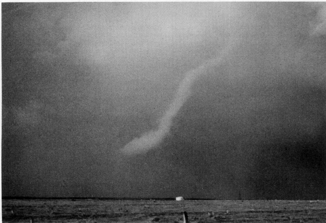
FIG. 1. The fifth tornado, about 30 km north-northwest of Canadian, Texas, 8 May 1986, at (a) and (b) 0037 UTC, (c) and (d) 0038 UTC. View to the northeast.

Tornadoes formed repeatedly from wall clouds in the Canadian storm. The fifth and final tornado (0037-