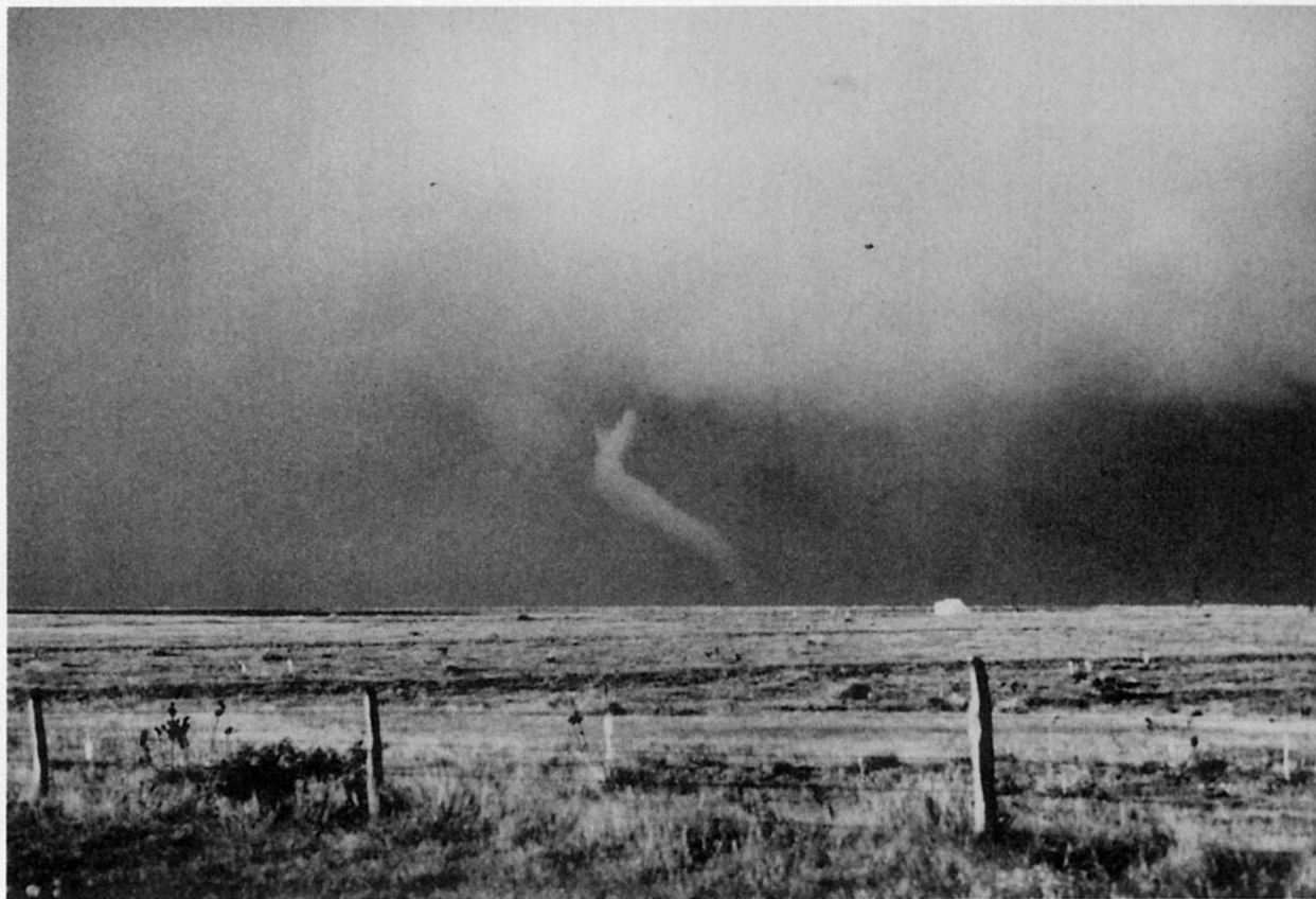
FIG. 1. (Continued)

0038 UTC 8 May 1986) was unusual, however, in that it formed on the back side of the storm.