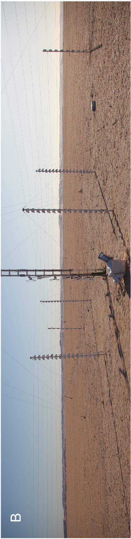
Fig. ES1. (a) Schematic of the arrangement of a single axis of the DTS (not to scale). (b) Photo of the installed dense section facing southwest. The large mast in the center supports sonic anemometers but is not used in the suspension of the DTS cable.